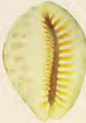
Figure 3 a